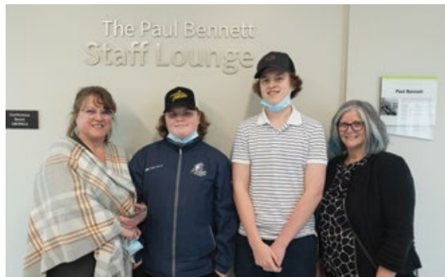
NEW Paul Bennett Memorial Staff Lounge