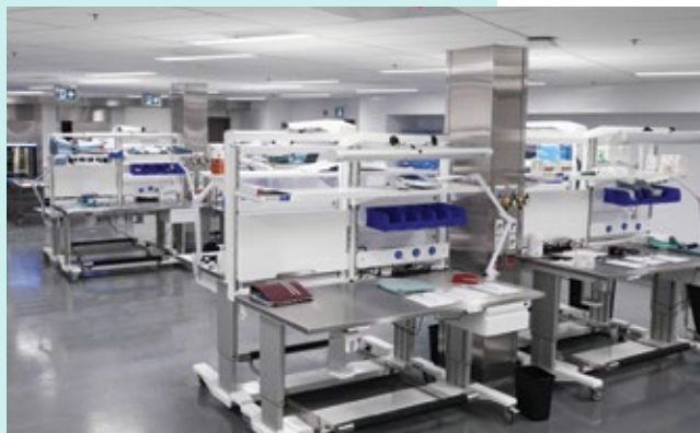
NEW Medical Device Reprocessing Unit

The entire medical team is so grateful for the addition of this wonderful new staff lounge, and the generosity that made it possible.