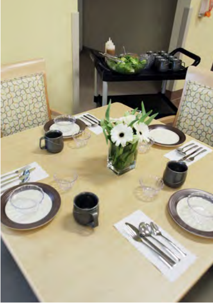
A sample dining table set-up at PAH Foundation Lodge.