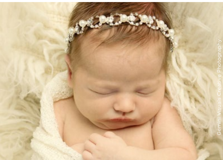
Gemini Visuals Creative Photography

It's a wonderful way to celebrate a new life and the proceeds will go towards the purchase of vital medical equipment for Peace Arch Hospital.